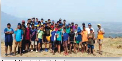
Lonavala Camp Trekking - Lohagad

स्नेहसदन म्हणजे प्रेमाचा घर. मी ह्या घरात २०२० मध्ये आलो. मला स्नेहसदन घर क्रमांक ६ मध्ये ठेवण्यात आलं. अंकल आणि ऑटी हे आमचा सांभाळ व काळजी घेतात. स्नेहसदन मध्ये आमचा सर्वांगीण विकास व्हावा म्हणून विविध कार्यक्रम व स्पर्धा आयोजित केले जातात. जसे क्रिकेट, फूटबॉल, बुद्धिबळ, कॅरम, लुडो इत्यादी सारख्या स्पर्धा आयोजित केल्या जातात. तसेच वेगवेगळ्या विषयांवर अधिवेशन घेऊन चांगले जीवन जगण्यास आमहाला मार्गदर्शन केले जाते.