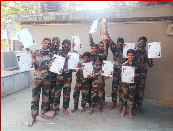
3 rd in Dance Competition @Pahachan by Being Human Organization