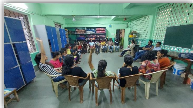
A meeting of Boys and Girls above 18 years

Morning coffee and taking a phone go hand-in-hand for every new day. Greeting parents with soft kisses have fully vanished today, Having fun time with family seems a waste of time. Checking What's App and being live on Instagram has become as important as breathing. Enjoying the games on the net but not on campus. The world is a mess to protect young brains, Not too early, not too late, Life's game can be changed