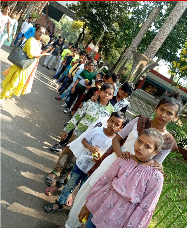
Visit to Nehru Planetarium and Science Centre