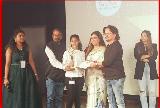
1 st in Drawing Competition @Pahachan by Being Human Organization