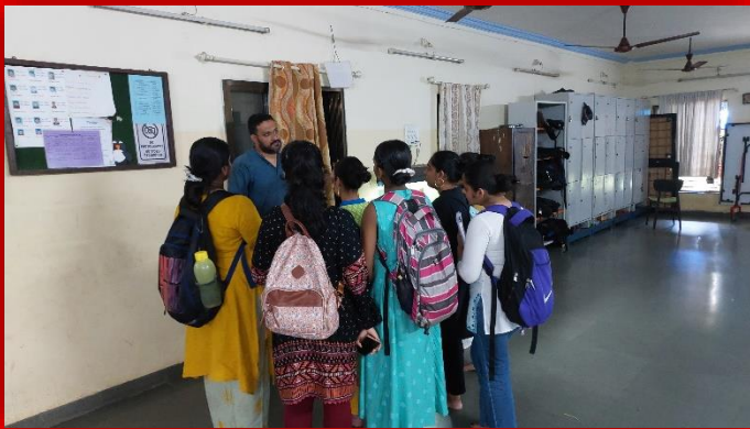
College Students for internship