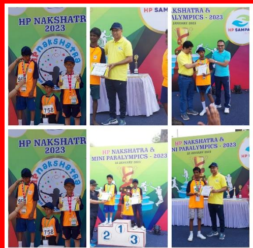
2 Gold and 6 Silver Medals at different sports event HP Nakshatra by BHUMI organization