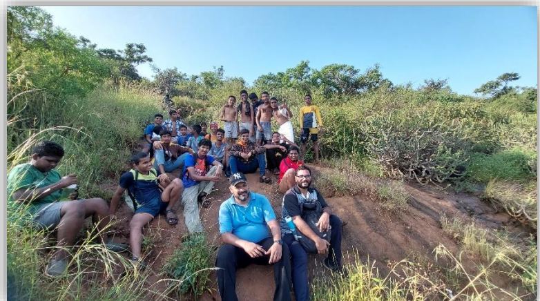
Lonavala Camp Trekking