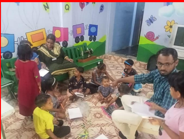
Nirmala Niketan Social Work Students at 'Amchi Kholi', CSTM