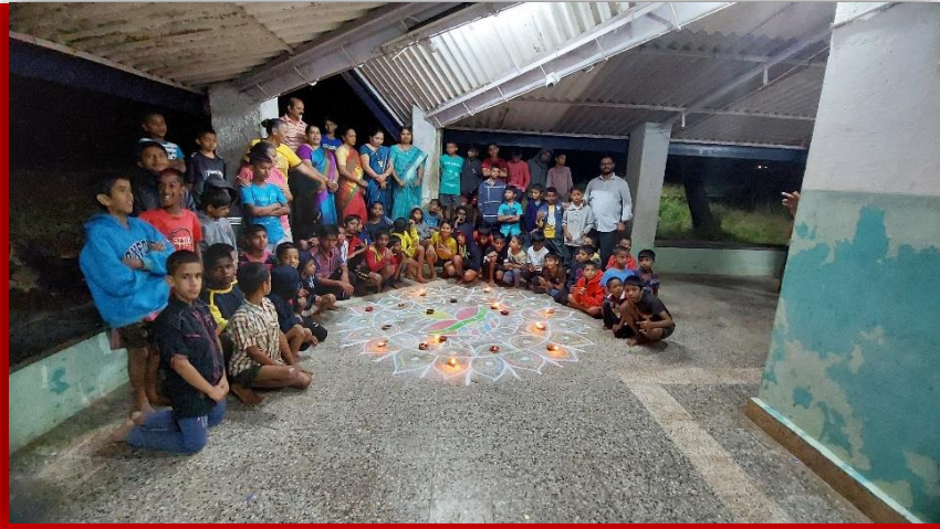
DIWALI CELEBRATION IN LONAVALA CAMP – NOV 2022