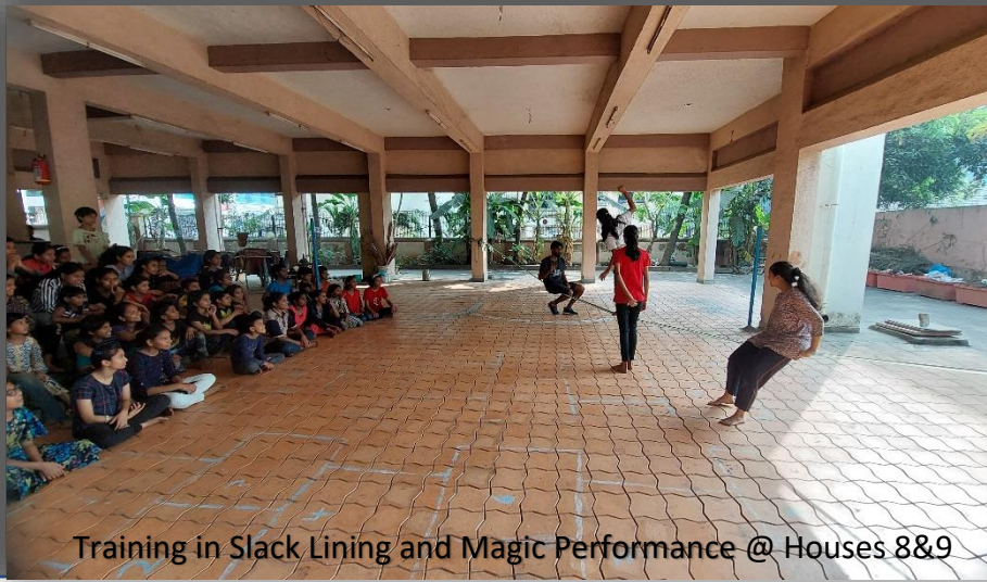
Training in Slack Lining and Magic Performance @ Houses 8&9