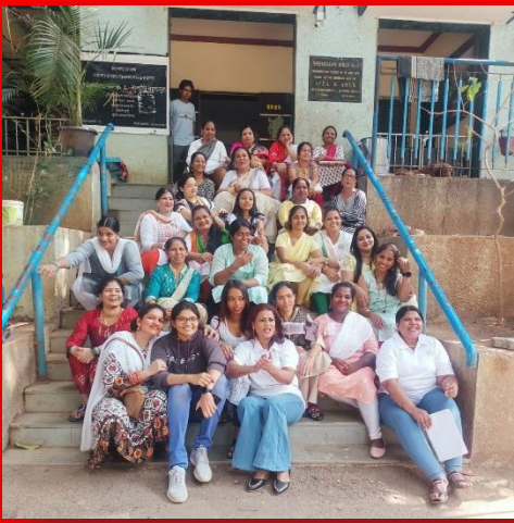
We Love Snehasadan