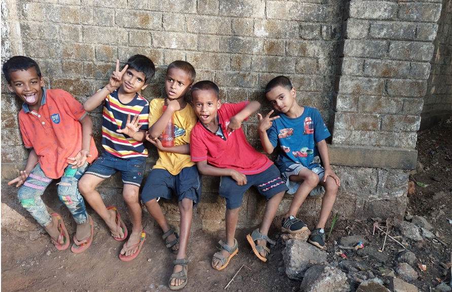
Picture is captured near a garden in Lonavala, May 2022