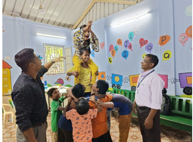
Activities at Amchi Kholi Contact Centre, CSTM