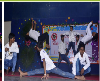
Dance performances by the children