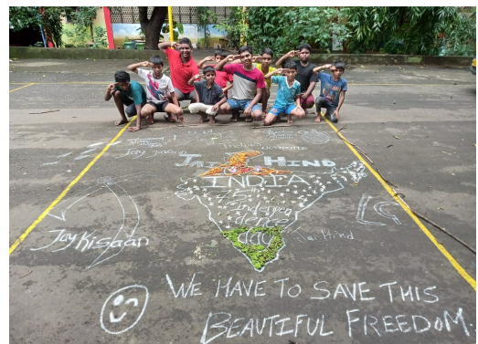
75th Independence Day Celebration