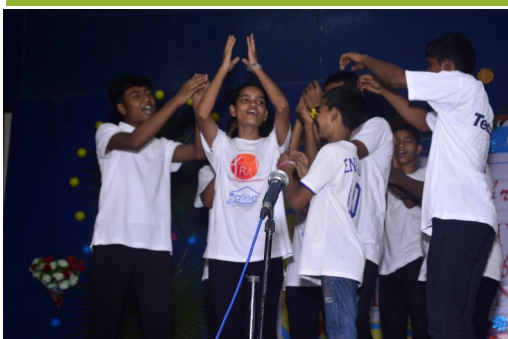
Street play by Snehasadan children