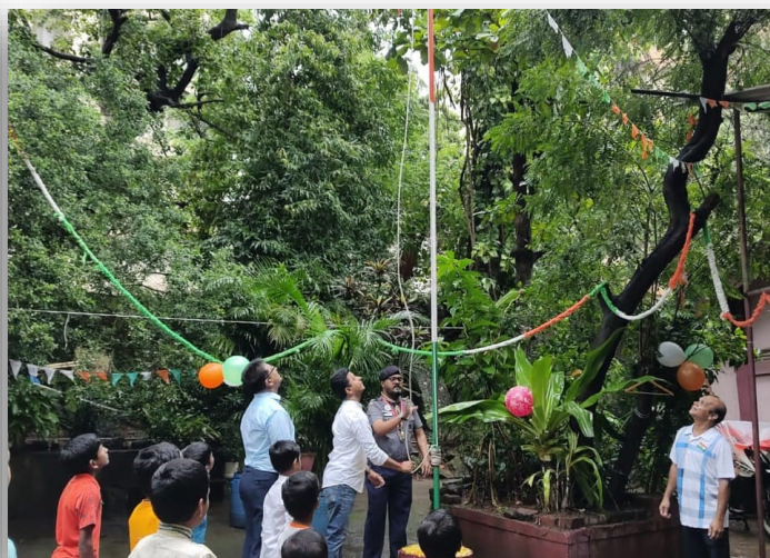
75th Independence Day Celebration in House No. 6