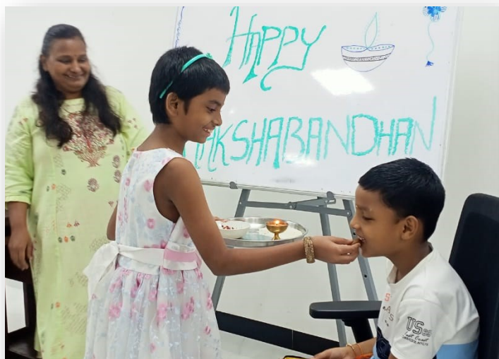
Rakshabandhan Celebration in Snehasadan. Siblings come together and share the joy of perfect bonding.