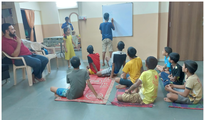
An interaction with the children