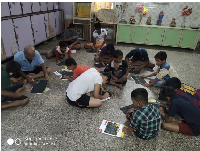
House Parent taking studies of the children