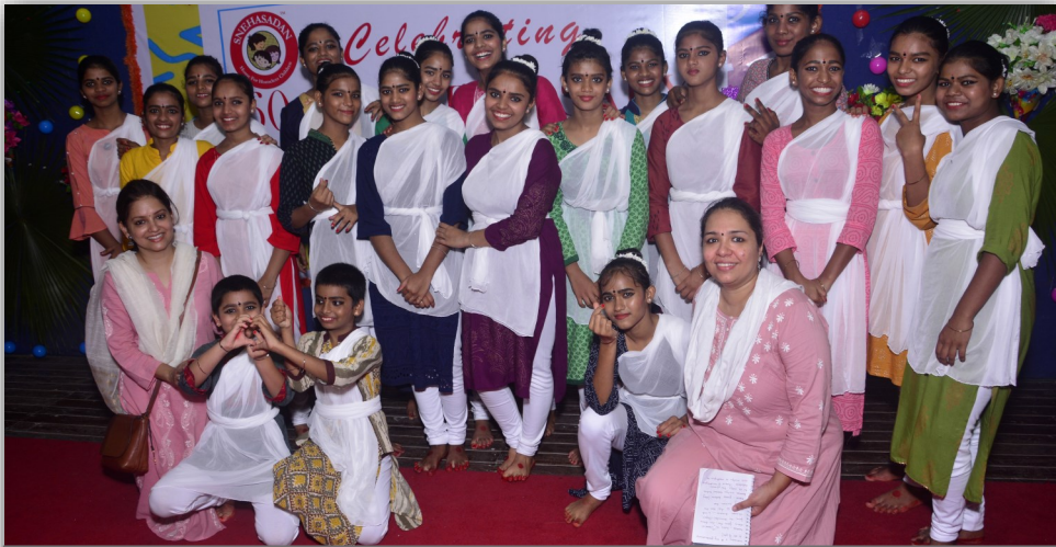
60TH ANNIVERSARY CELEBRATION KATHAK DANCE

Snehasadan a home of love completed 60 years of Love and Care on 29th June 2022. The journey of 60 years of service is filled with varied experiences. Some of those experiences are penned in the books "Tracks" and "The Luckiest Ones". You can ask for the copies of these books from our Head Office. Besides, each of our newsletter contain some stories of our present and past children. This Newsletter brings to you the children's thoughts about their experience of Snehasadan.