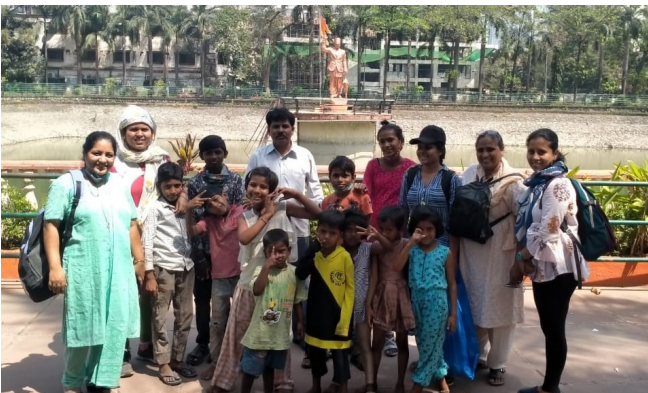
Activities at Nivara Contact Centre, Borivali