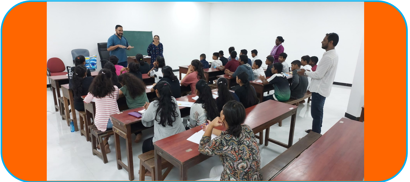
Seminar on Stress Management and Study Skills